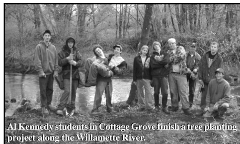
Al Kennedy students in Cottage Grove finish a tree planting project along the Willamette River.

name _____ address _____ _____ phone _____ Interests _____ _____