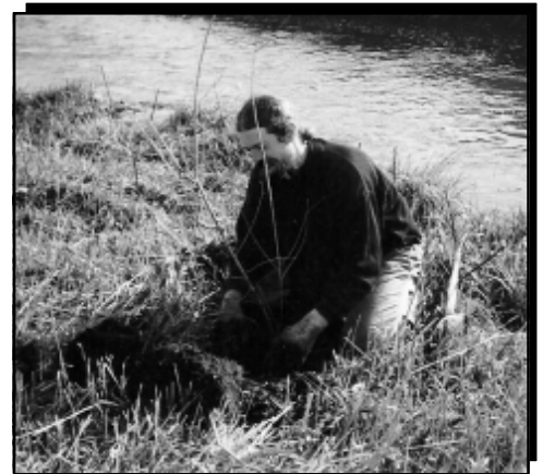
Riparian enhancement along Cedar Creek in Marcola.

Autumn/Winter 2004-05 ~ Crews worked diligently for six straight months pulling weeds and planting trees in public open spaces. WRP partnered with the Mid Fork Willamette Watershed Council to enhance riparian habitat at seven sites along Lost Creek. Blackberries were cleared to make way for an array of native shrubs and trees along this salmon-spawning tributary of the Willamette River. WRP also worked with the McKenzie Watershed Council to expand the once abundant bottomland hardwood forests along the river's edges. Crews planted, mulched, and staked over two thousand trees near the McKenzie River and its tributaries. Restored site locations ranged from east of Thurston to the confluence of the McKenzie and Willamette rivers north of Eugene. Re-vegetation projects in Eugene include a one-acre planting project at Lambs Cottage in Skinners Butte Park. WRP planted a diverse assemblage of over 3,500 plugs (of native grasses and forbs) near the Willamette River.