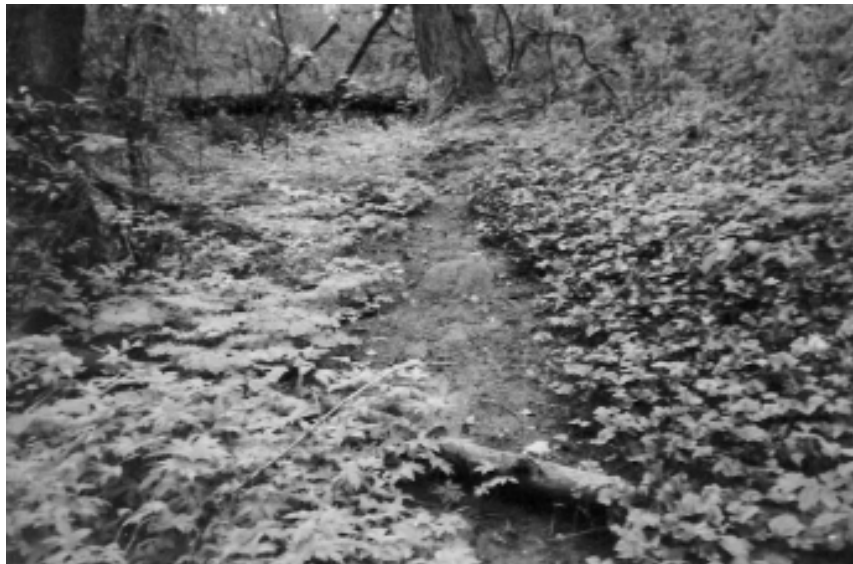
Stark contrast between native species and English ivy

It's hard to imagine restoration of the forest in Hendricks Park without Walama and their great partnership. They have worked with the park's staff and Friends of Hendricks Park to bring a spirit of renewal and hope to park's community, adding dignity to the hard work of science, education, restoration and community building.