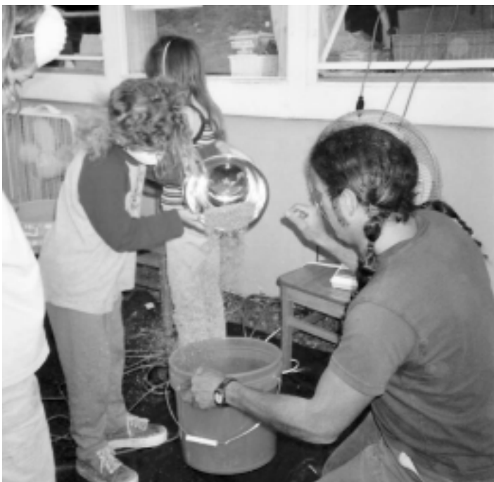
Third graders practice winnowing native prairie seeds.

Our fall seed saving workshops included visiting native Willamette valley habitats resembling intact wetlands and wet prairies. Prior to the visits, WRP staff facilitated classroom activities covering the value of prairie habitats in our bioregion and their historical/cultural roles in the Willamette valley. WRP introduced the concept of native seed collection and propagation for the continuation of maintaining our valley's fragile ecosystems. Eugene schools visited Gudu-kut Natural Area, a local wet prairie located near City View street, and Territorial School, rurally located in Cheshire, visited Kirk Park, a wetland adjacent to Fern Ridge Reservoir. At both sites, students learned names of plants and wildlife found specifically in wetland-related habitats. With the support of the Army Corps of Engineers and the City of Eugene Stream Team Stewardship Program, WRP staff engaged students in native wetland ecology, food chain games, and proper seed collection techniques at both parks.